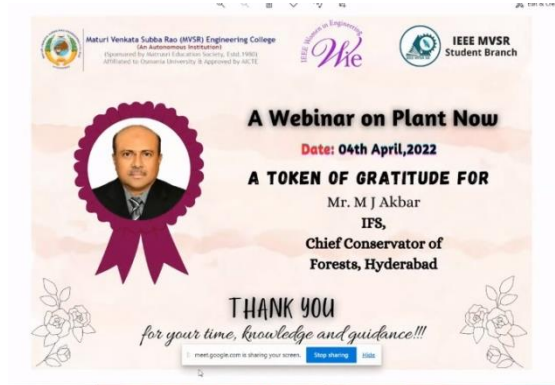
Token of Gratitude presented to our speakers